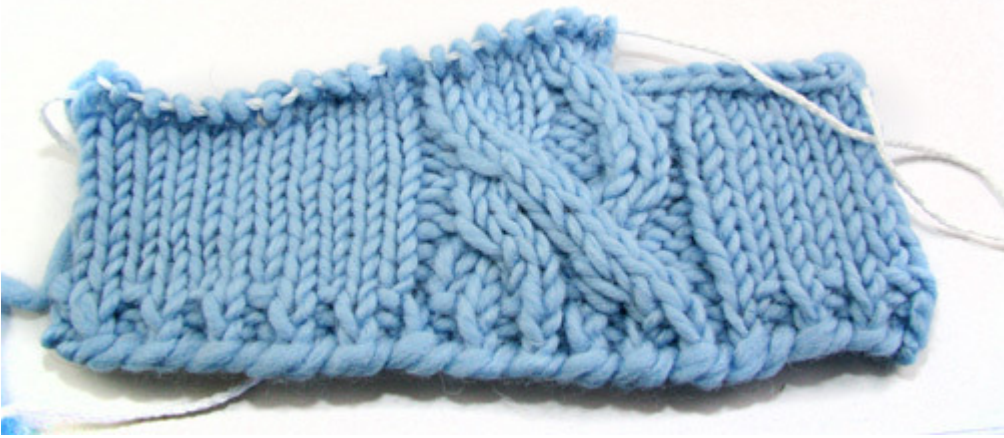
4. Short-Row Prep for 3-Needle Bind-Off, Back